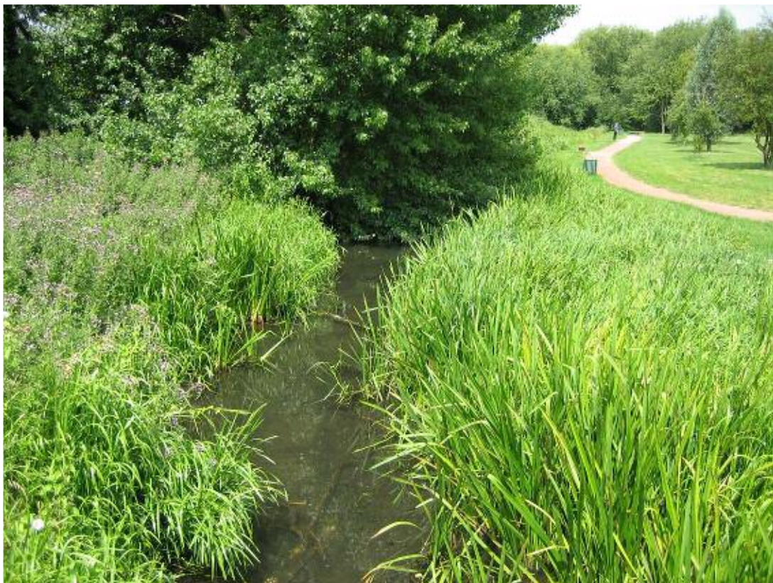
Reeds in York Stream north of Evenlode Bridge after re- spraying July 2011