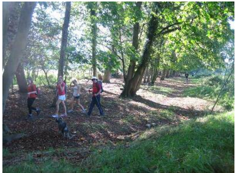
Walkers approaching bend in link