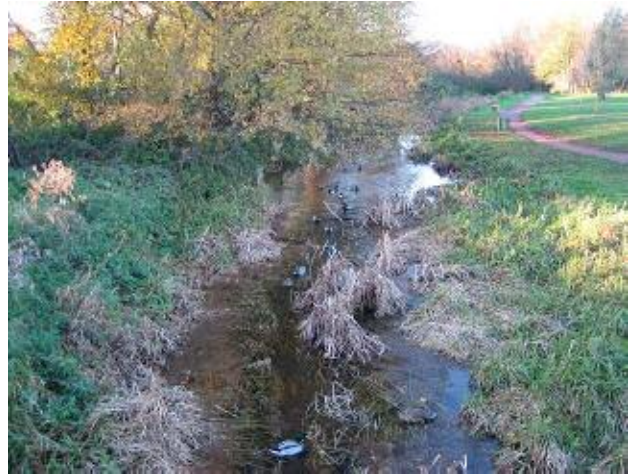
Reeds in York Stream north of Evenlode Bridge before spraying June 2010 (left), and the effect of spray on reeds November 2010 (right)