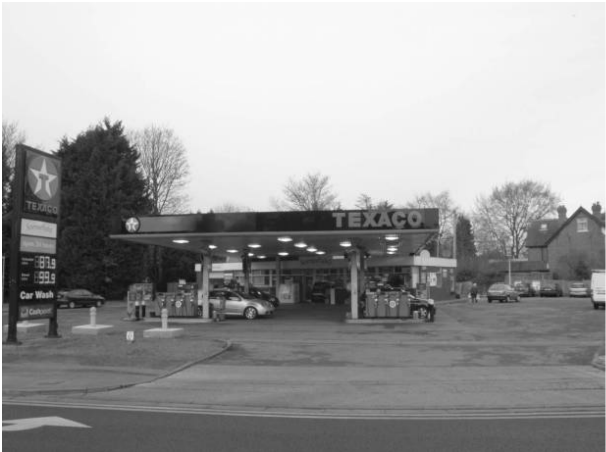
Texaco's site at the roundabout near Maidenhead Bridge

The application to enlarge and refurbish the Texaco filling station by Maidenhead Bridge was a re-submission of a similar proposal in September 2007. The new application had a more modest increase in the retail area and visually appeared to be single storey – although staff and services had accommodation on the first floor. The design and materials were more traditional – as befitting a ‘conservation area’. Our concerns were in two main areas: firstly, the amount of plastic fascia and signage, and secondly the increased traffic flow generated by the expanded operation. It is anticipated that traffic movements will increase by more than 35%. It is also proposed that the middle entrance/exit will be closed off. This will generate a major increase in vehicle movements exiting the site – primarily onto Ray Mead Road which is already a problem.