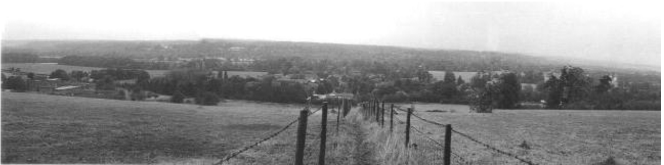
The view from Prospect Hill, near Hurley

The following photos show “quiet roads” and vistas to be seen from the walk.