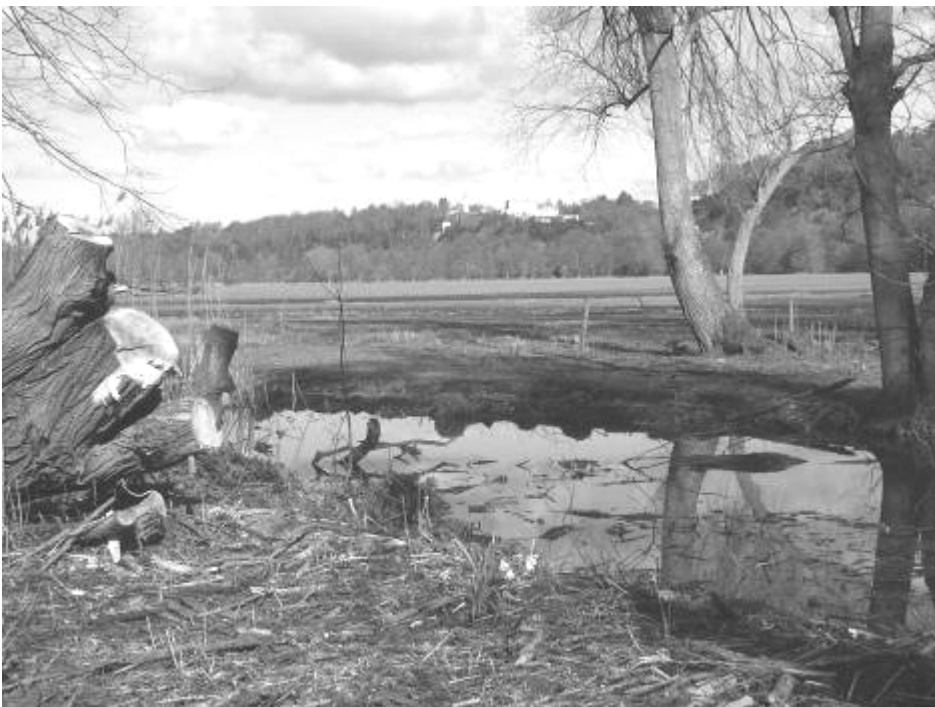
View of Cliveden from near the eastern end of the Millennium Walk

As readers will know, there are still a few “missing links” in the route, in particular the safe crossing of the main road in front of Temple Golf Club, and the final stretch from the Lower Cookham Road to Maidenhead Riverside, and we are continuing to fight for these.