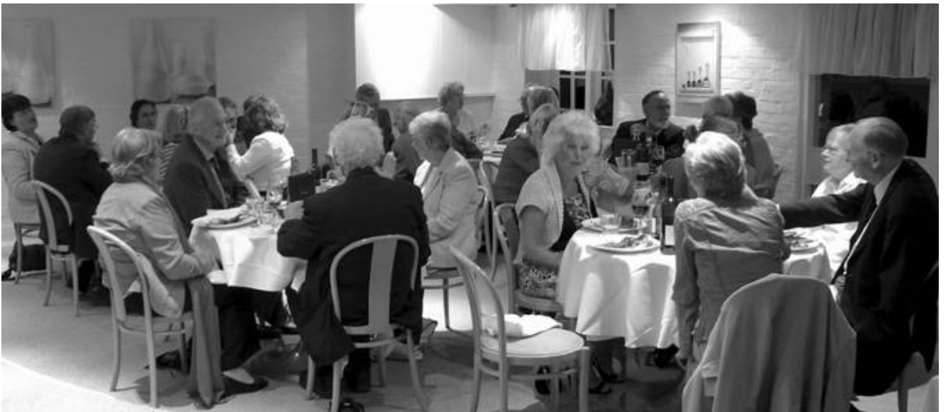
Society members enjoy a social occasion with the visitors from Bad Godesberg

We do hope that you can join us and we can have a convivial evening together in this very pleasant venue.