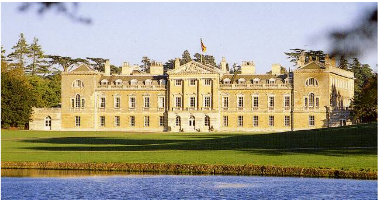
The West Front, Woburn Abbey

We will see their garden and be able to visit the 40 antique shops in the grounds. It promises to be a day of interest and contrasts to interest all ages.