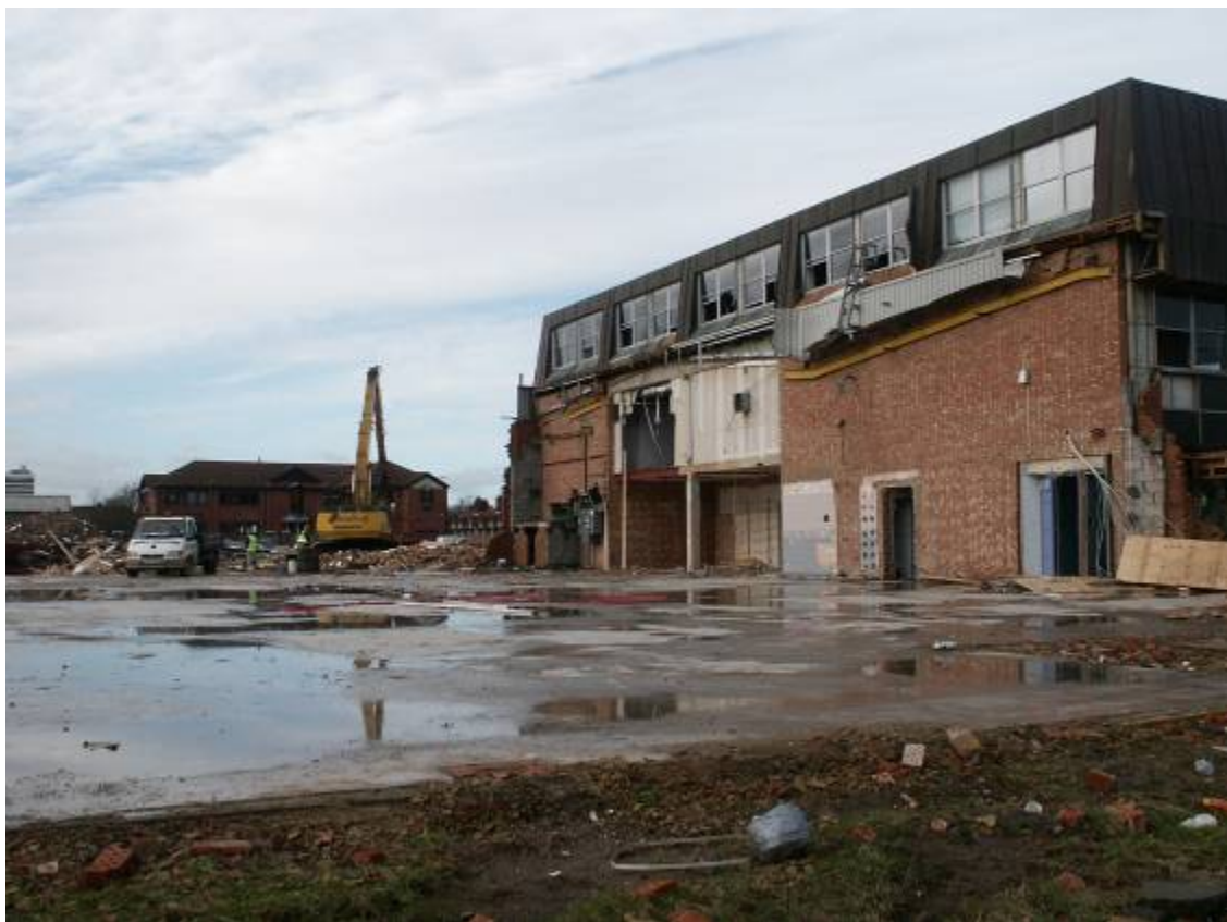
Just the old office block left – January 2004

If you drive along the A4 into Maidenhead, you can't have missed the demolition of the industrial premises that once occupied this site on the corner of Oldfield Road. Work has been in progress for some time now, and is anticipated to be complete by the end of the month. There will then be a large, flat empty space until one of the various applications in respect of the re-development is approved.