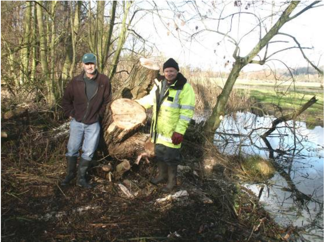
Environment Agency personnel clearing trees near the White Brook