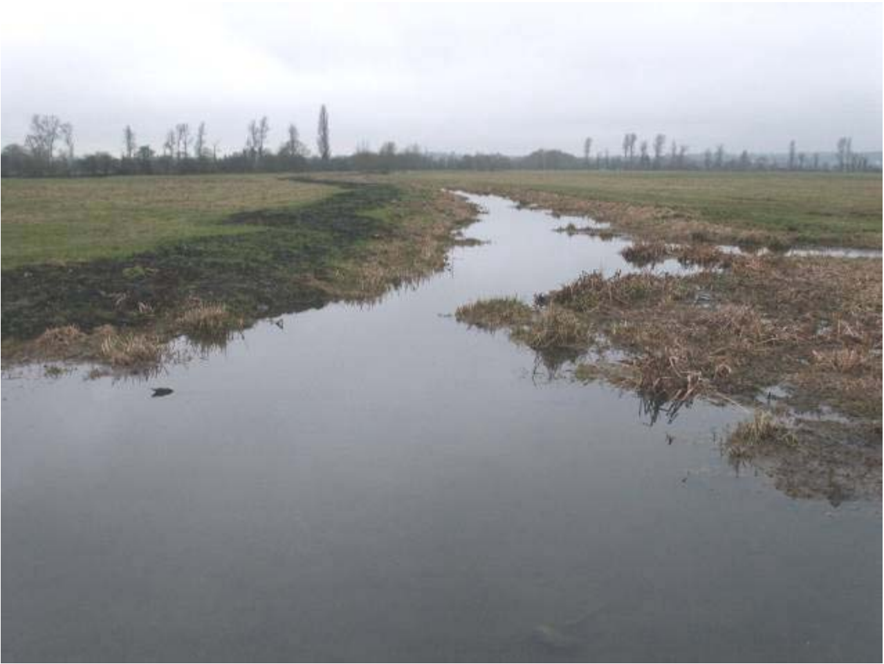
The White Brook east of the Lower Cookham Road, January 2004

Further inland the water depth at the sluice footbridge on the loop to the north west of the junction with Strand Water (see map) had been steadily increasing; as of 1 st January measuring 70cms (28inches). However as this water flowed towards Maidenhead it was impeded by reeds/silt causing it to slowly disappear into the ground. No doubt the dry summer further aggravated the situation.