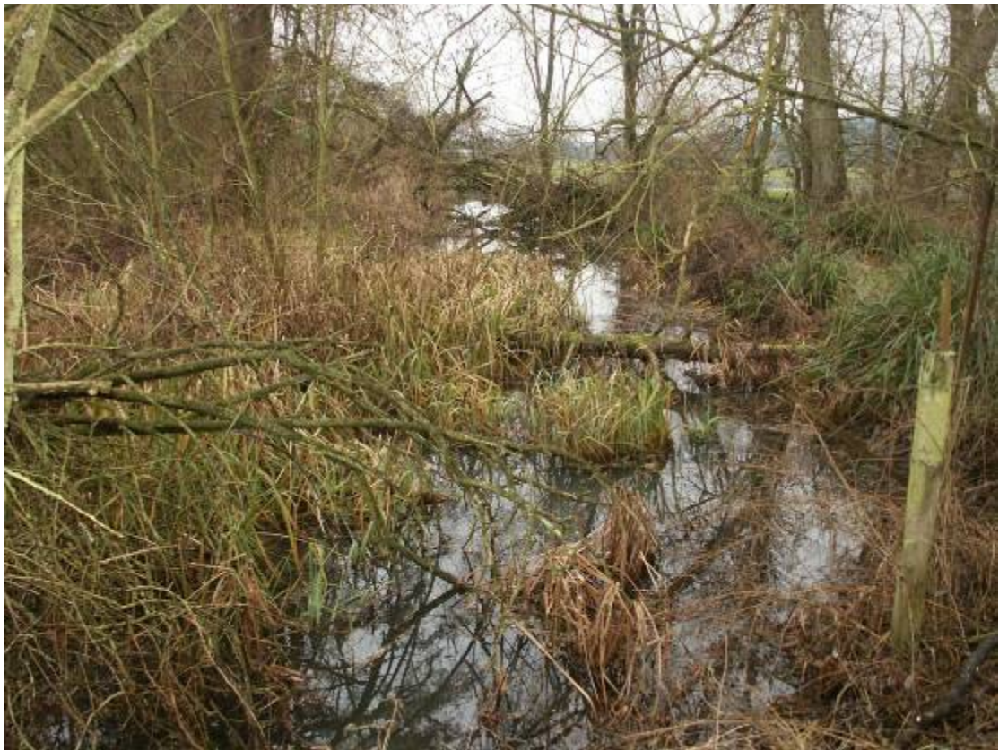
The White Brook before tree clearance, January 2004