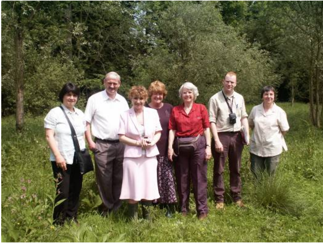
Site visit after the meeting