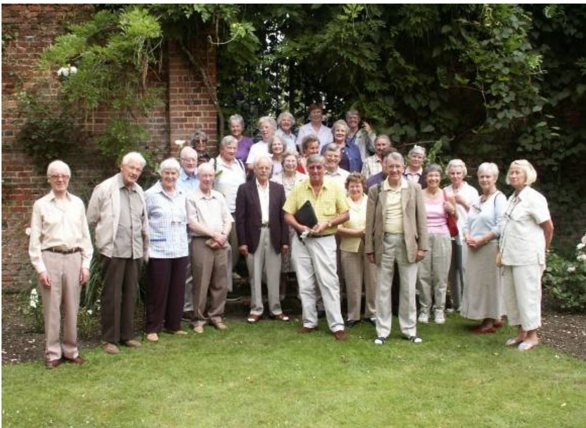
A successful Civic Society trip to Highclere Castle and Broadlands