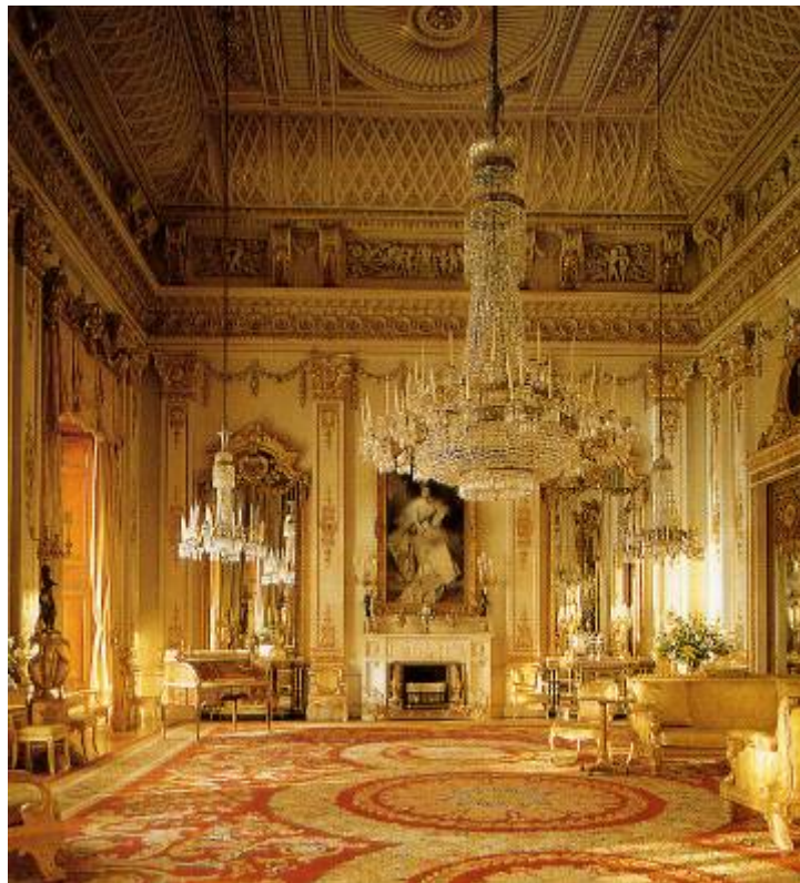
The State Rooms

On Saturday 20 th September we will be visiting Buckingham Palace, where we have managed to secure a limited number of tickets to visit the State Rooms and special Coronation Exhibition, the Royal Mews with the Coronation Gold State Coach on display and the Queens Gallery, which has a special exhibition of the Royal Treasures. There is also an exhibition by Leonardo da Vinci called "The Divine and the Grotesque". All of these visits are by timed tickets and there will be time for lunch between the State Rooms and the Royal Mews.