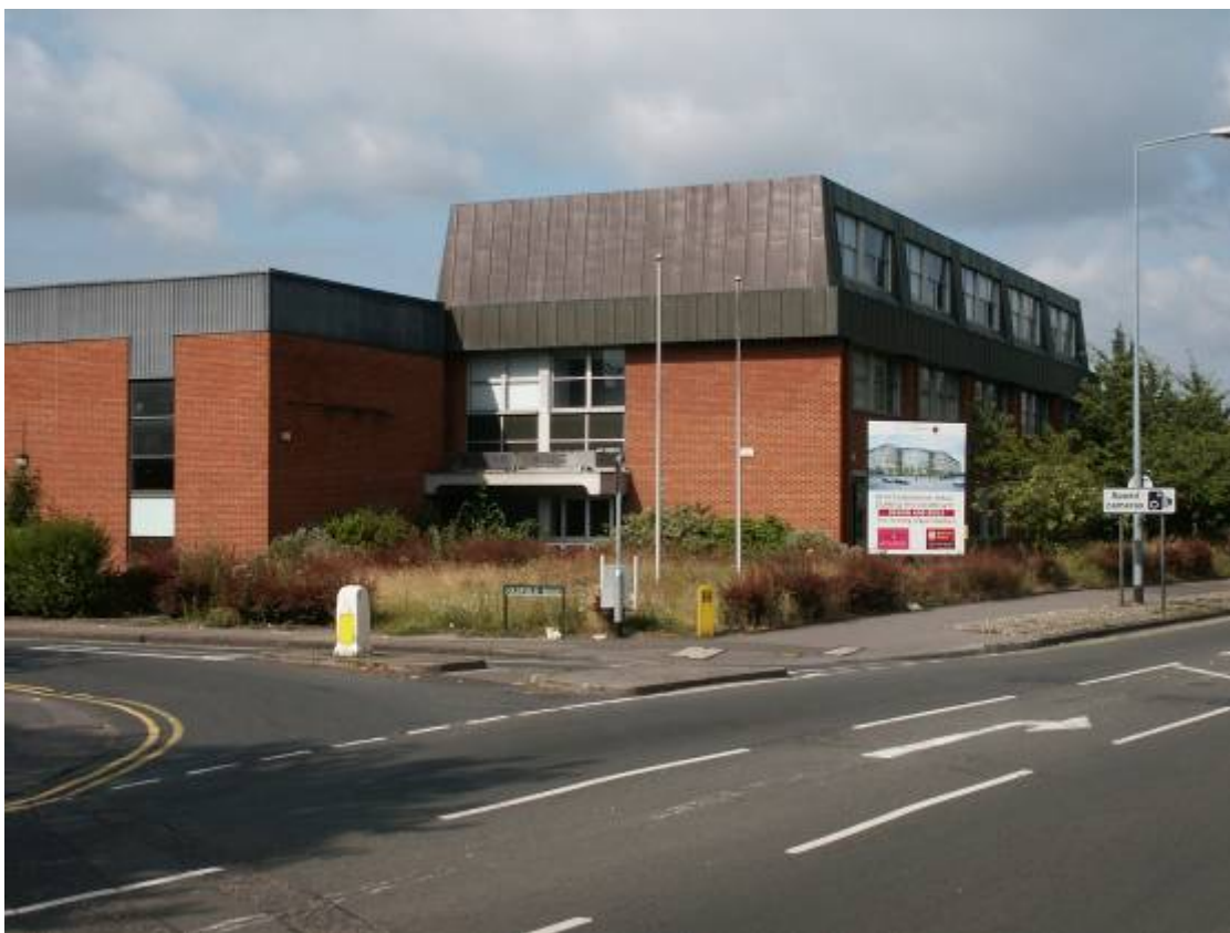
The near derelict Meridian House at the corner of Bridge Road and Oldfield Road

“The supportive element of our previous comments on this important site have been in proportion to the amount of housing included in the Applications, so we remain supportive of the fact that the whole site is now being considered for this purpose. We particularly welcome the sheltered housing, and the extensive open area for children is a worthwhile inclusion. The limited availability of parking is a concern.